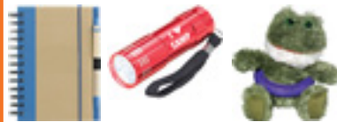
Journal, Flashlight, Plush