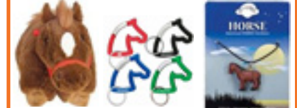
Pillow Pal, Carabiner, Necklace