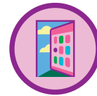
My Cookie Team