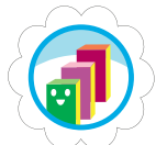
My First Cookie Business

2. Earn one of the Cookie Business badges to help you discover new skills. Each badge has digital marketing skills built right in.