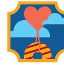
My Cookie Business Resume