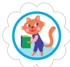
Cookie Goal Setter