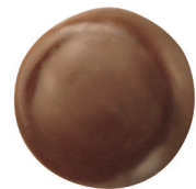
Peanut Butter Patties®