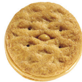
Peanut Butter Sandwich