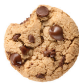
Caramel Chocolate Chip